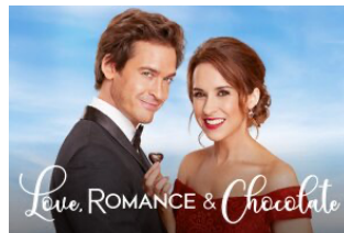
Lacey Chabert in Love, Romance & Chocolate on GREAT! Romance.