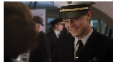
Leonardo DiCaprio in Catch Me If You Can on GREAT! Movies.

This year marked its first foray into original productions, with sister company Narrative Pictures producing ' Christmas at Plumhill Manor ' which had its UK premiere on Great! Christmas . The Christmas rom-com reached over half a million individuals (based on watching 3+ mins) in the first week of running.