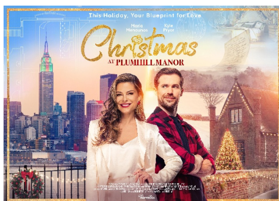
Christmas at Plumhill Manor